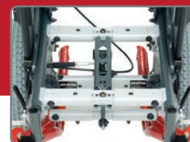
Adjustable seat width

Seat width , adjustable 12" – 18" Seat depth , adjustable 13" – 18" Seat height , adjustable 13" – 20" Back angle , adjustable 90° – 120° Back height 20" and 25" Dynamic tilt 50°