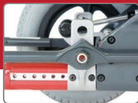
Adjustable axle position