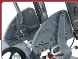
Adjustable seat depth and back rest