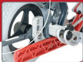
Adjustable seat height

Nine standard frame colors to choose from and custom colors also available. Contact us for details.