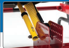
Actuator adjusts for optimum size