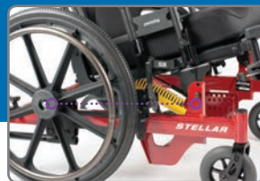
Easily adjustable axle position