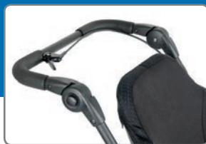
Adjustable push bar option