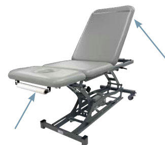
Paper Roll Holder and Cutter (EPTPH01)