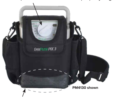
Exhaust vents and mesh area properly aligned

Control panel and clear window properly aligned