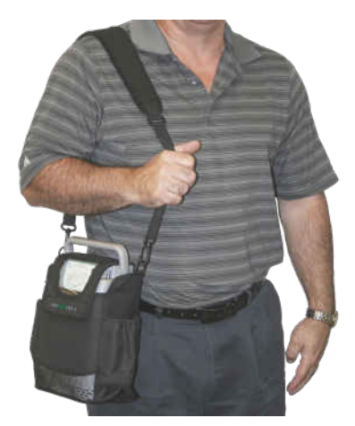
Proper carrying position