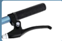
Manual hand brake