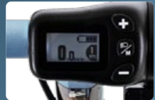
Digital LCD display