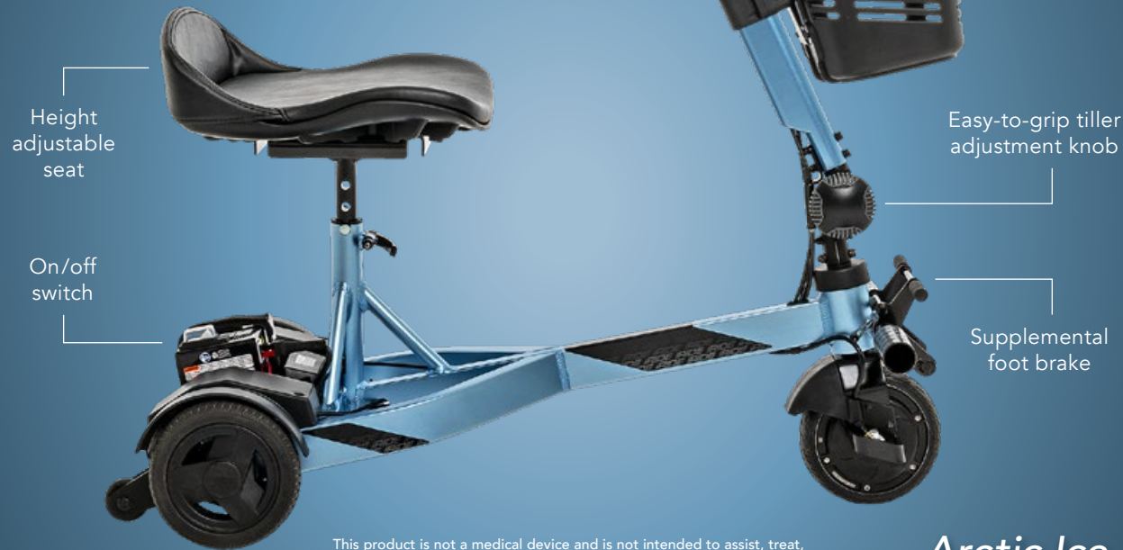
Height adjustable seat