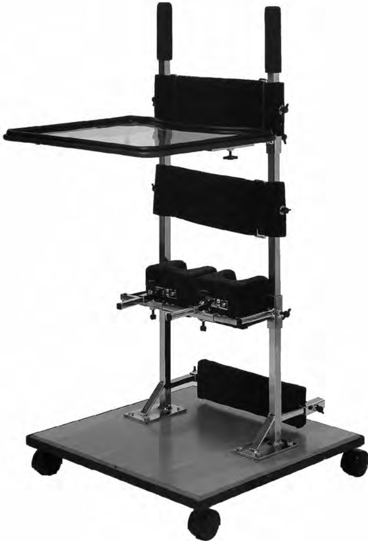
Shown with optional wheeled caster base.

The UP-RITE STANDER is a therapist designed upright standing frame which allows unobstructed access to the client from all sides supplying the ability for proper midline positioning for proper weight bearing and activities involving the upper extremities.