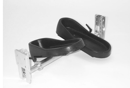
Multi-Adjustable Foot System

These instructions are included as a supplement to your owners manual and should be kept for future reference.