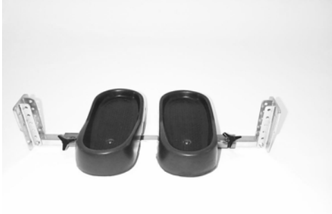
Height Adjustable Foot System

Your new Granstand has been ordered with a mobile foot system. The following instructions are for the installation of one of these systems on a GRANSTAND II or GRANSTAND III Standing System.