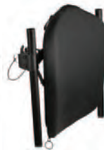
J3® PA E2613, E2614