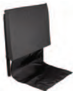
GO™ E2611, E2612