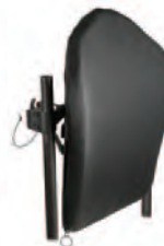
J3® PL E2615