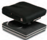
Lite™ E2603, E2604, E2607, E2608