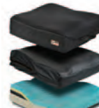
Union® E2607, E2608