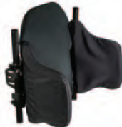
Focus Point E2620