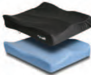
Soft Combi™ P E2605, E2606