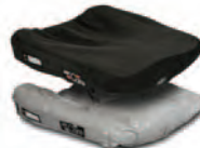
Care™ E2607, E2608