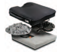
J3® E2622, E2623, E2624, E2625