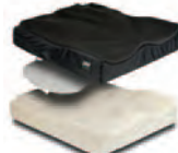
Easy® E2607, E2608