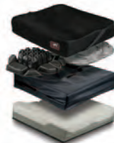
Fusion® E2622, E2623