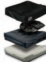
Fusion® CryoFluid™ E2622, E2623