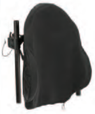
J3® PD, PDL, PDC E2620