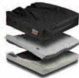
J2® Deep Contour E2622, E2623, E2624, E2625