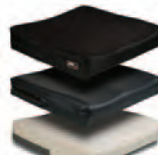
Ion® E2607, E2608