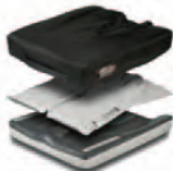
J2® E2622, E2623, E2624, E2625