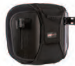
J3® Carbon Fiber E2613