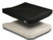
Basic E2601, E2602