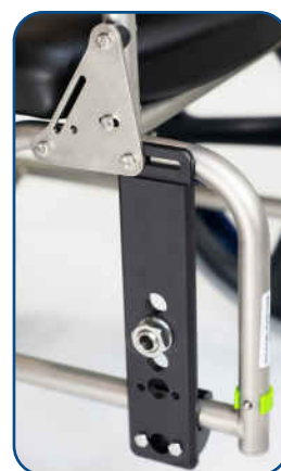
SP Axle Plate

Our design philosophy centers around the principle of modularity. Raz MSCCs can be configured to accommodate the client's medical condition and functional needs.