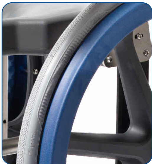
Ergonomic Handrim with thumb groove and finger notches