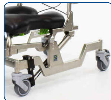
Super-Low AT (5" lower)