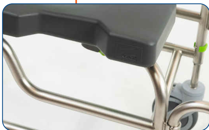
Unrestricted Side Access

Recessed, dipped front cross tube allows for better toilet bowl access and facilitates standing-pivot transfers