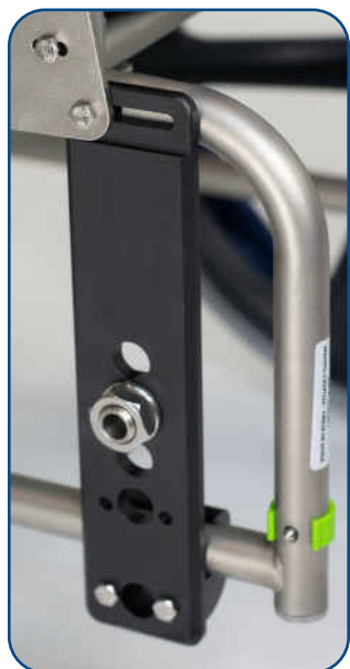
Adjustable Axle Plate