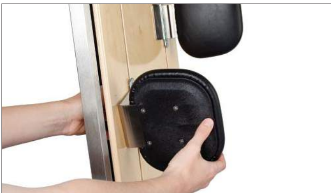
The laterals adjust easily even with the client in the Supine Stander.