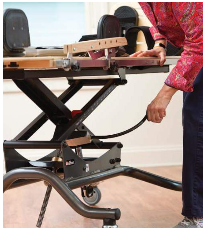
Use the frame's marked calibrations to record and maintain each user's optimal position.