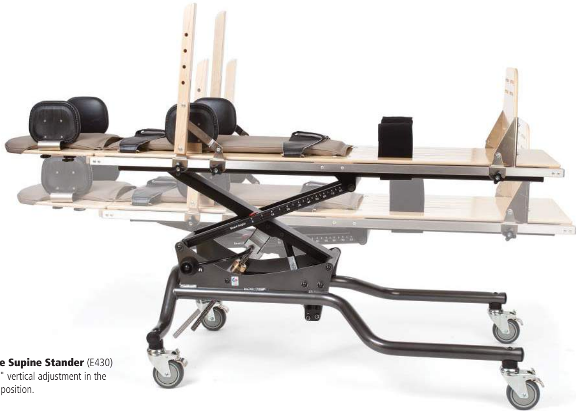
The large Supine Stander (E430) provides 9" vertical adjustment in the horizontal position.