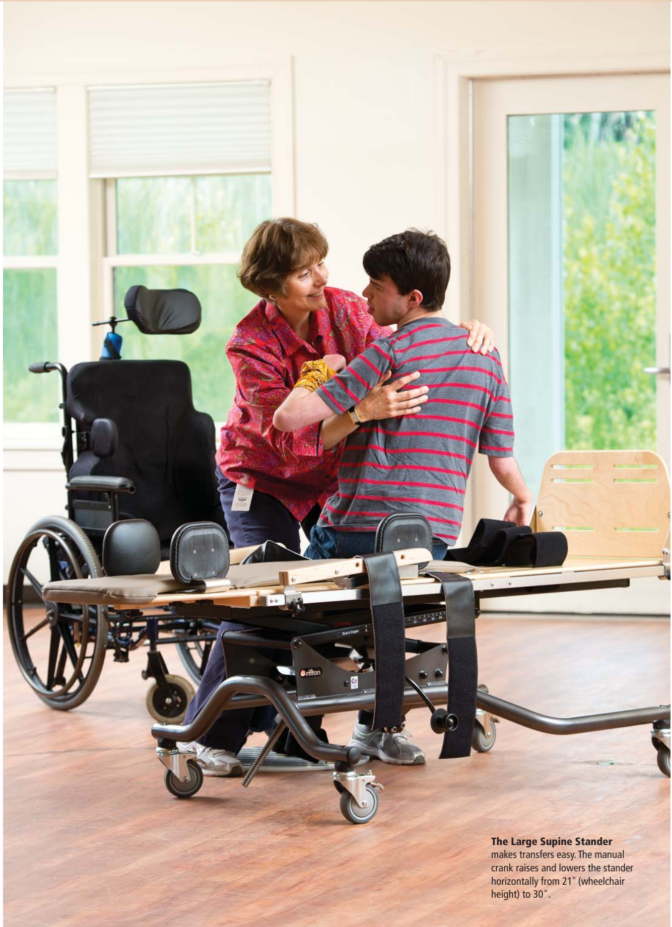
The Large Supine Stander makes transfers easy. The manual crank raises and lowers the stander horizontally from 21" (wheelchair height) to 30".