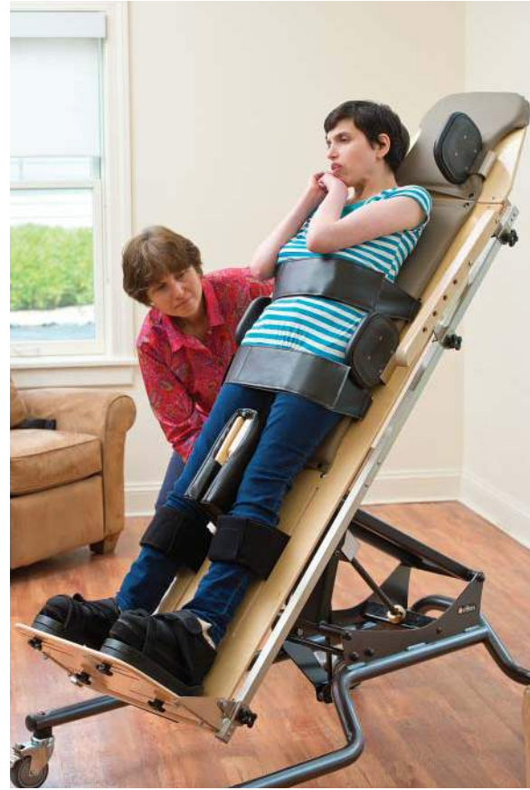
The Supine Stander stays secure at any angle. Turn the crank to gradually increase weight bearing.