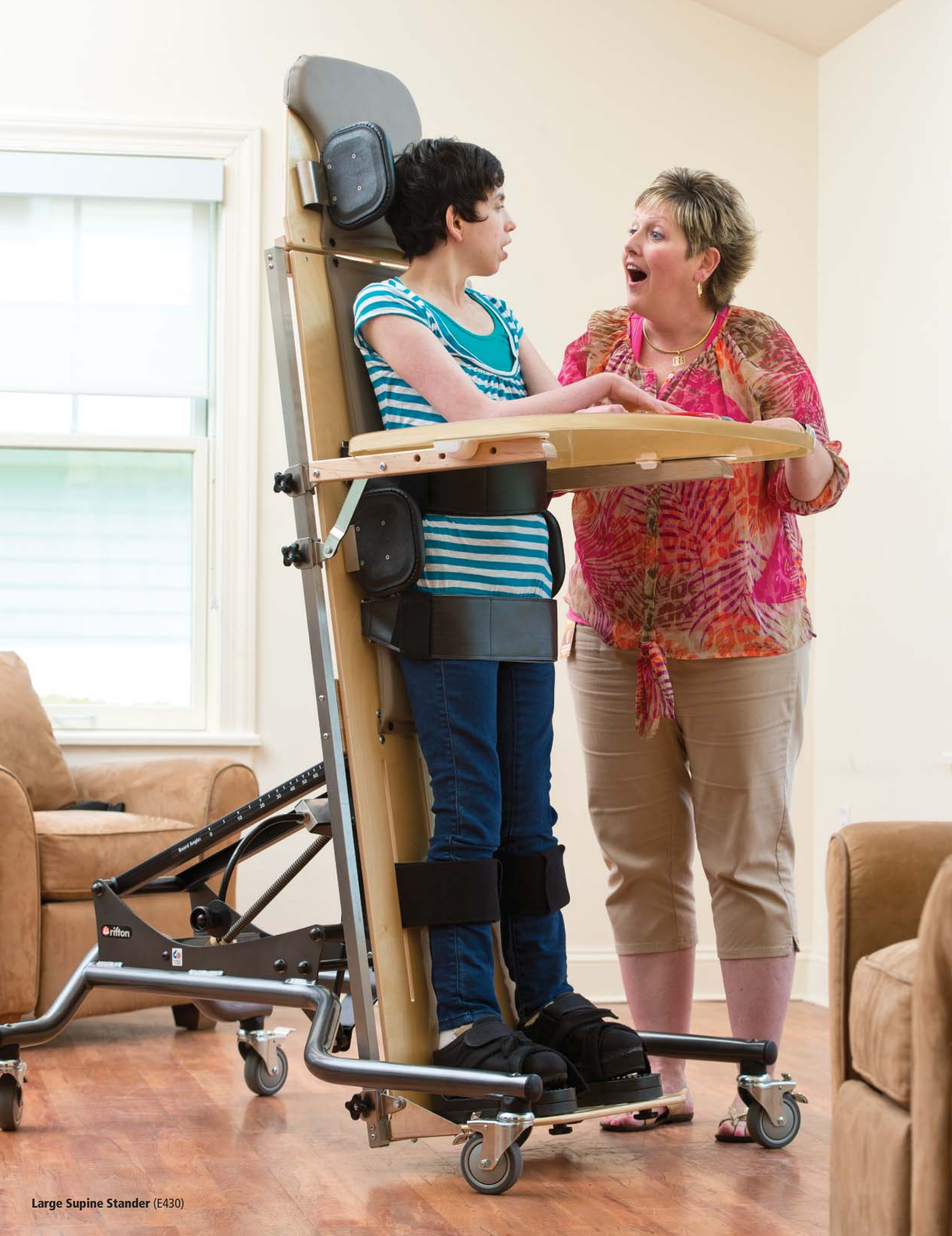
Large Supine Stander (E430)