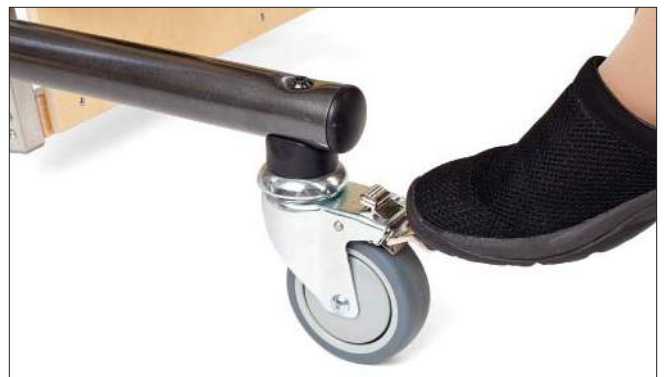
Double-locking casters prevent any roll or swivel during transfers.