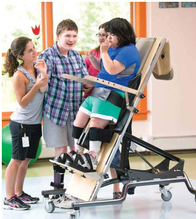
This child has advanced so far that the headrest can now be flipped back out of the way.