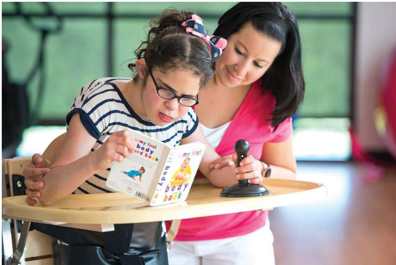
Supported by the hand Anchor, this child is able to participate in activities she enjoys.