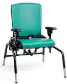
Large standard base R860 Rifton Activity Chair