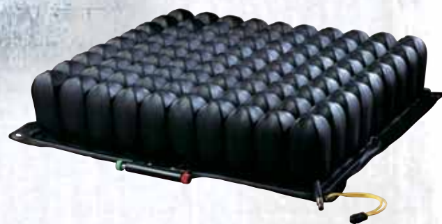
QUADTRO SELECT HIGH PROFILE

SELECT Series Cushions set the standard in the industry for overall performance in wheelchair seating. With the benefit of a customized fit through the simple push of a knob, the revolutionary ISOFLO MEMORY CONTROL® offers shape fitting capabilities while you are seated, allowing quick and easy, on-demand adjustment to maximize function. With the built-in stability and simplicity of a SELECT Series Cushion, no longer will you have to sacrifice maximum skin/soft tissue protection to get stability, positioning or convenience.