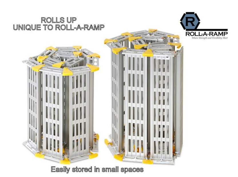
Why A Roll-A-Ramp® Highly Advanced Engineering - Superior Design