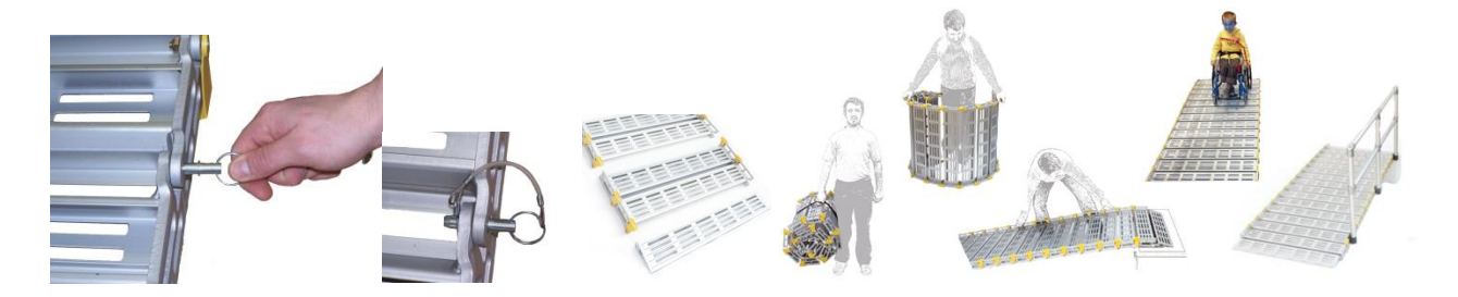
Simply put, the most flexible, versatile and portable ramp available – at any length

No matter long it is the ramp can be set up by anyone