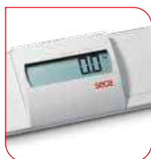
The patient's BMI can be determined when their height is entered.

The low platform profile reduces patient effort and risk when stepping on the scale. As the 22 x 22 inch platform is almost twice as large as that of a normal scale, a chair may also be placed on the scale for weighing a patient. With the pre-TARE function, the weight of a chair or standing aid can simply be tared away. Up to 3 TARE weights (e.g. chair weights) can be stored.