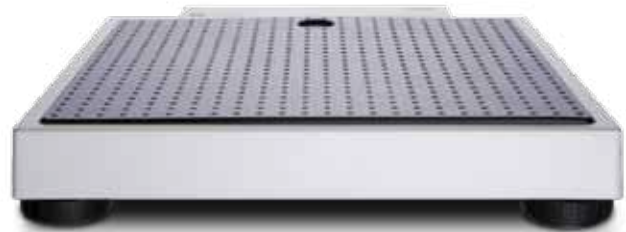
The flat design and slip-proof surface ensure easy access and a secure stance.