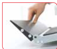
Integrated ramp folds up for troublefree transport.

After weighing, the seca 676 can be folded together in no time at all to save space. The sturdy locking device between rail and platform ensures the scale stands safely also when folded together. The rail also serves as handle when the scale is folded together, meaning that the seca 676 can be moved and stored away easily and quickly on the smooth-running transport castors.