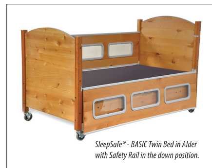
SleepSafe® - BASIC Twin Bed in Alder with Safety Rail in the down position.

SleepSafe® Beds is a domestic USA manufacturer of custom safety beds, featuring removable safety side rails, designed to address the issues of falls and entrapment for those with special needs. Models include SleepSafe®-Low Bed, SleepSafe® II- Medium Bed, and SleepSafer®- Tall Bed, offering progressively more safety rail to mattress height.