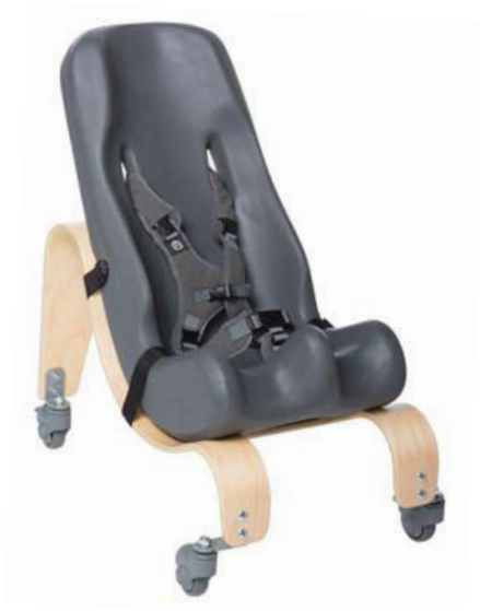
Sitter with Mobile Base