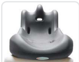
Contoured head and lateral support, shown as top view