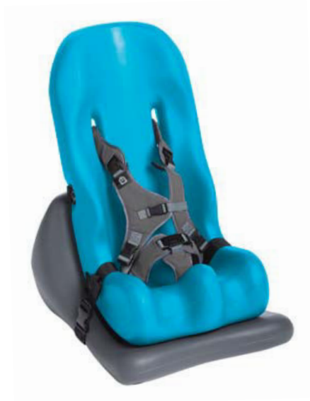
Floor Sitter Kit for Sizes 1,2,3