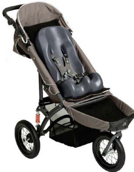
Jogger for Sizes 1,2 (page 22)