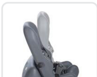
Sleek modern design provides up to 25° of tilt