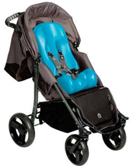
EIO Push Chair for Sizes 1,2 (page 20)