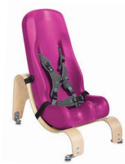
Sitter with Stationary Base