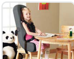
Attachment straps for securing to a standard chair