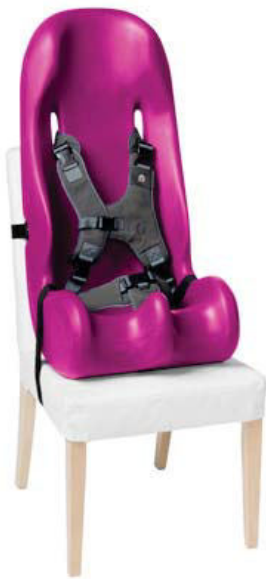
Attach to a chair

Sitters can be used in a variety of ways