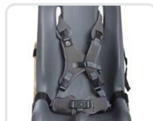
Adjustable 8-point harness