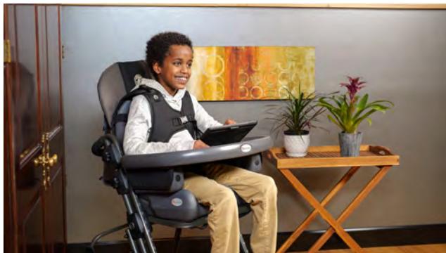
Shown with optional Special Tomato Seat & Back Liners, Small Tray & Arm Rests