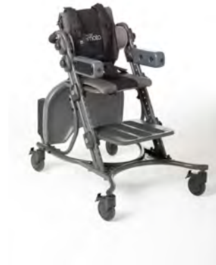
Shown with Arm Rests, Tray & Tray Holder

Sturdy construction designed for school use, but small enough to use in the home!