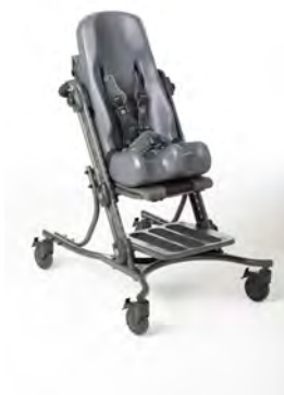
Shown with Special Tomato Soft-Touch Sitter (sz 3)

Sturdy construction designed for school use, but small enough to use in the home!