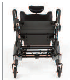
Width-Adjustable Strut Tubes