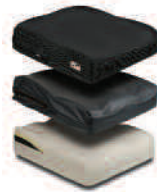
Union™ E2307, E2608