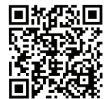
MONO™ Backrest System Video