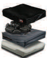
Fusion™ E2622, E2623