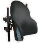
J3™ Posterior & Deep Lateral/Contour E2620