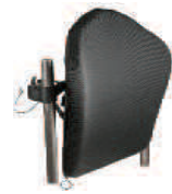
J3™ Posterior & Lateral E2615