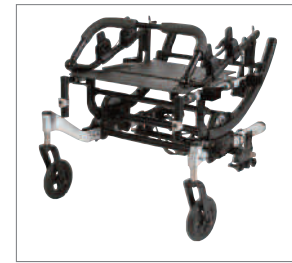
Compact Base and Fold-Down Back Canes