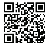
Quickie Hanger Video