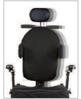
Midline Backrest Offset