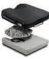
J3™ E2622, E2623 E2624, E2625