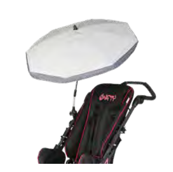
Umbrella (shown on size 1)