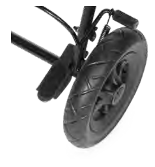
Tip assist (shown on size 2)