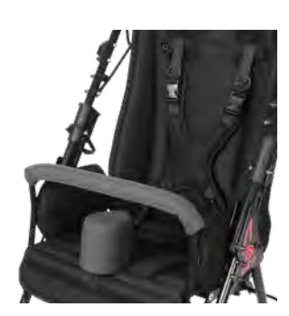
Butterfly chest harness (flexible), abduction block and grip rail (shown on size 2)