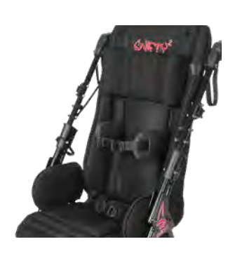
Head pillow, lateral trunk support with chest belt and 2-point pelvic harness (shown on size 2)