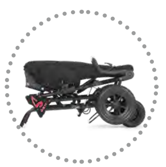
Small folding size (even size 2) -Especially quick and easy to fold with a flick of the wrist.

The lightweight rehab strollers for both small & big kids