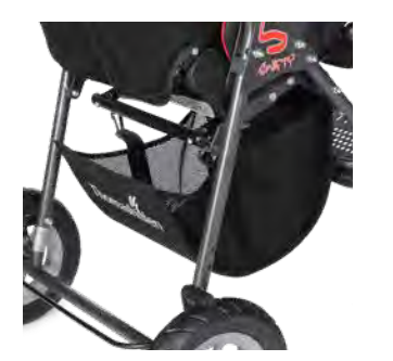
Basket (shown on size 1)