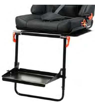
417 Footrest, foldable, angle adjustable