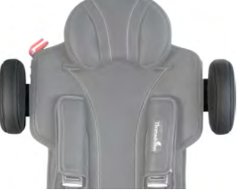
427 Shoulder guides