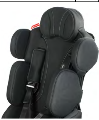
405 Lateral trunk supports, swing-away