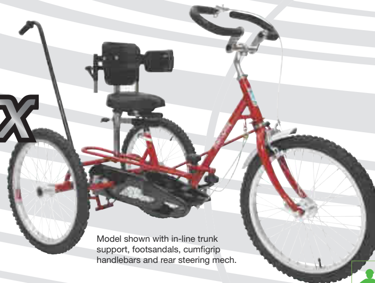
Model shown with in-line trunk support, footrests, cumfigrip handlebars and rear steering mech.

A robust tricycle designed to accommodate the larger and heavier child. The TMX has 20" wheels, a caliper brake with a parking brake mechanism and an option which allows the frame to be folded for transportation and storage.