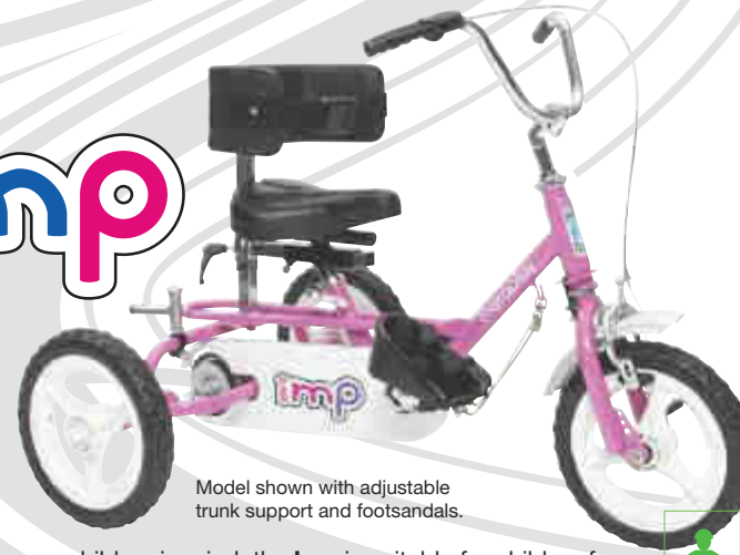
Model shown with adjustable trunk support and footrests.

Designed with younger children in mind, the Imp is suitable for children from around 2½ years. It has a low gear ratio for easy pedalling, 12½" wheels, caliper brake and smaller diameter handlebars for smaller fingers and hands.